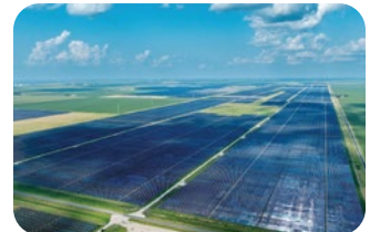
Double Black Diamond community benefit agreement