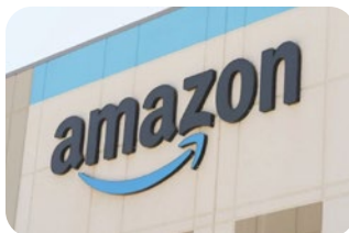
Amazon warehouse opening