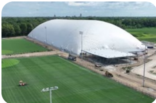
SCHEELS Sports Park dome inflation & opening