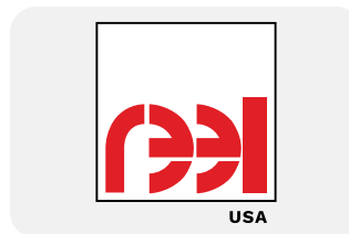
REEL USA Corp manufacturing site