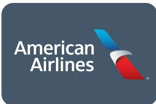
American Airlines new departure and arrival times at Fly SPI